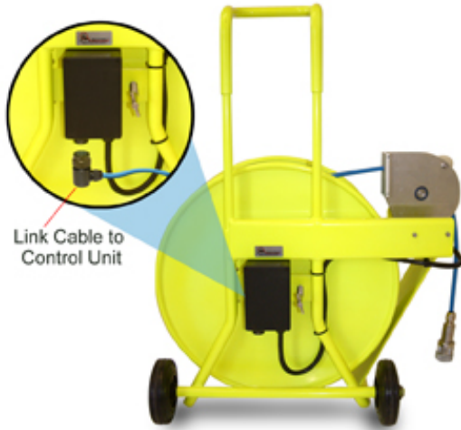
Link Cable to Control Unit