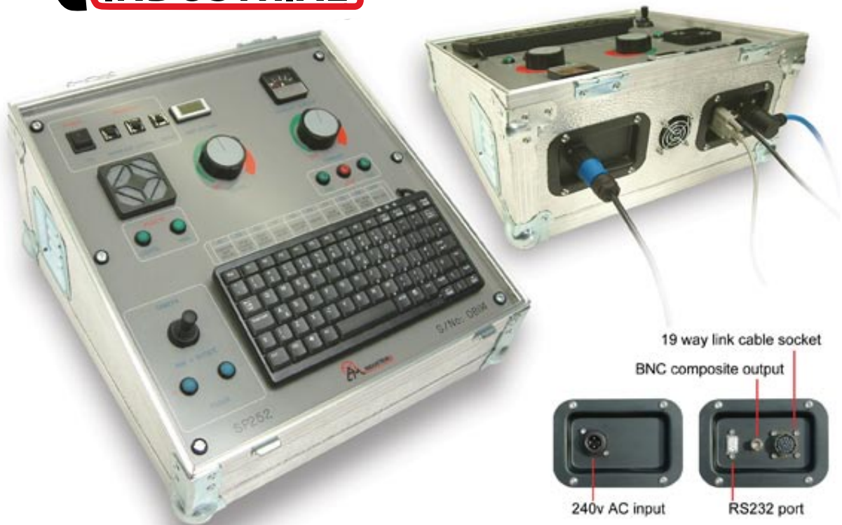
19 way link cable socket